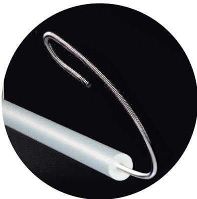
J-tip and deflection curve

With the Marsman SpeedWire™ you can easily speed up your next antegrade femoral access procedure and do it right the first time.